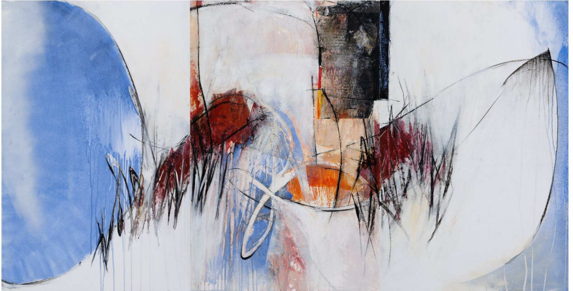
Simplicity # 9 Acrylic on polimer. 2011 78 x 40 Triptich