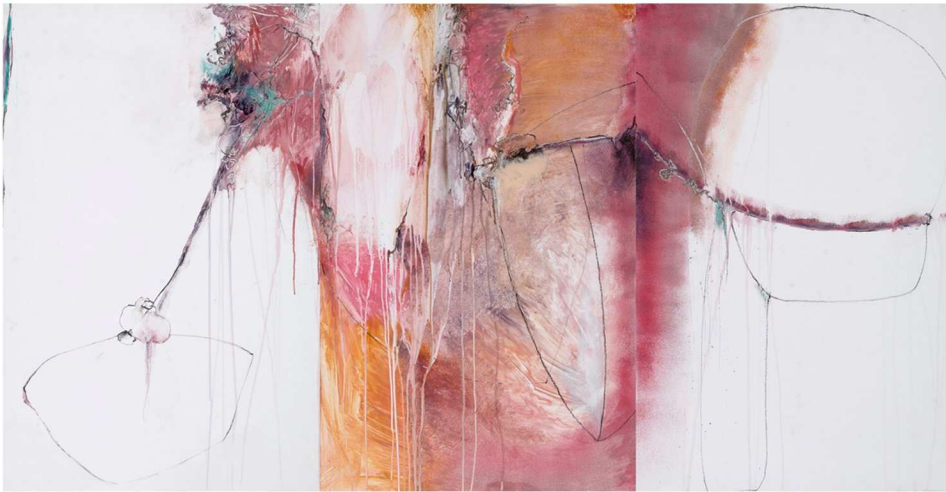
Insight With Heart, 2013, Acrylic on Polimer 78 x 40 Freestyle III, 2011 Acrylic on Paper 40 x 40, Right