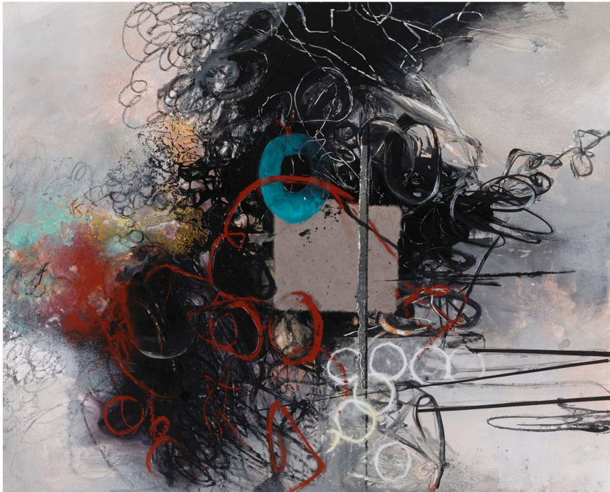
Freestyle O, 2013, Mix Media, 26 x 33